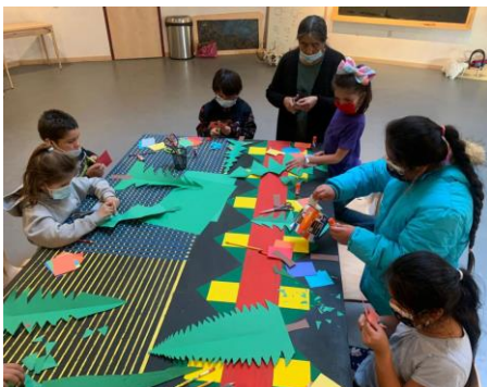
PHOTO: Students (Grades 1-3) making a large holiday decoration for their classroom wall.